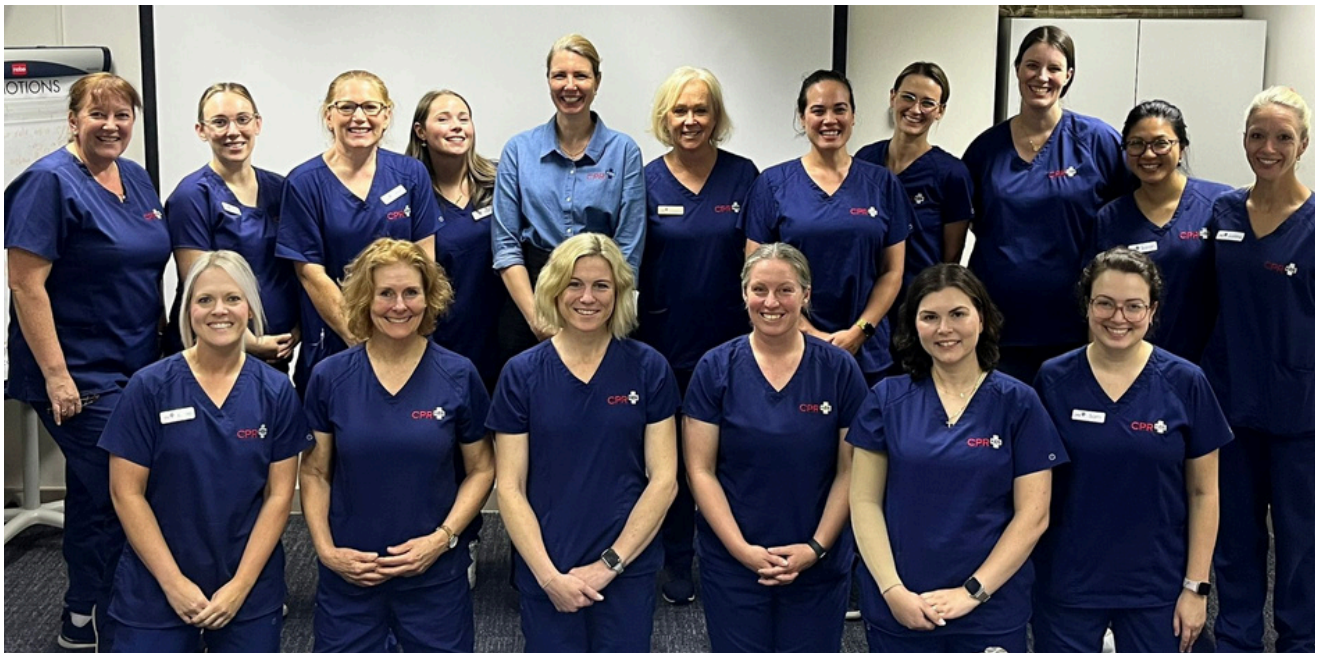
Some of the fabulous CPR Kids Nurse Educators

CPR Kids partners with 22 public and private maternity hospitals to provide our classes to the community. A key component of this partnership is providing hospital-wide paediatric first aid education sessions for over 300 midwives, nurses, doctors and allied health staff in the past year.