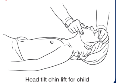
Head tilt chin lift for child

One or two hand position for child compressions